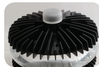
Shown with optional GPS antenna