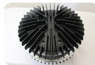
Precision upper heat sink

The SL-300-2 lantern is available with a class-leading integrated, low-powered Type 1 or Type 3 AIS. When fitted, the AIS is encapsulated within the body of the SL-300-2 to maintain the weatherproof integrity.